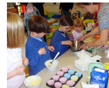
Making fairy cakes