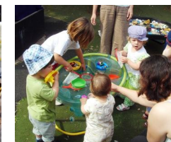
The fishing game

We made our own sandcastle cakes, had a fruit snack and a Rainbow Fish puppet show at the end.