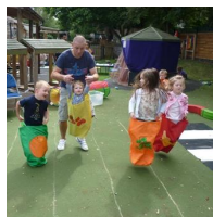
Having fun with the sack race

The children loved hunting for the Buggy Buddies and following their ideas for Physical fun! Pipo the Ant asked us to do an obstacle course, with a sack race. Webster the Spider asked us to collect pine cones and mint from our vegetable garden.