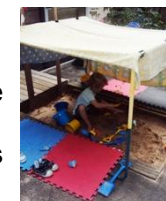
Keeping safe in the sun

'The Train Ride' story took us to the seaside at Berrygrove Children's Centre! What a surprise! There was a 'rock pool' with real seaweed, a 'beach' with small world figures, a big boat to climb into with fish and real snorkelling gear and oars, and we really needed our paddling pool and funky fountain!