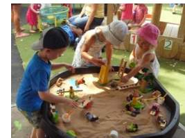
At the beach