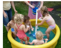
The paddling pool and 'funky fountain'

As usual, we have had a very busy time over the summer, with our Family Fun sessions at the children's centre and N Watford Methodist Church and Picnic in Garston Park, in addition to other regular groups and sessions. Unfortunately, the weather was not all that it might have been and the Family Picnic on 4th August had to be cancelled. However, all our themed Family Fun sessions went ahead and were well attended. Thanks to all the families who came and made them such a success. Your positive feedback was much appreciated by the staff and volunteers involved in the planning and running of them.