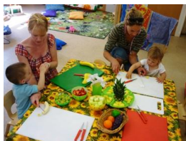
Making fruit kebabs

We all made our own fruit kebabs for a healthy snack at the end.