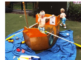
Fun in the boat and snorkelling