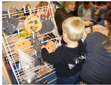
Making masks, bats and cats