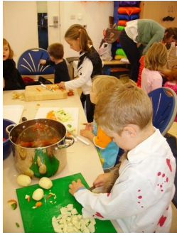
Cutting up the vegetables

The sessions were very well attended and everyone took part in the fun. We had face painting, making spiders, drawing bones, storytime, making soup and outdoor play on the trim trail.