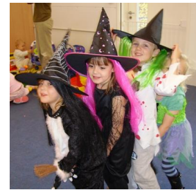
Playing on broomsticks